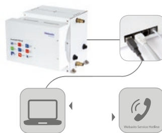
BlueCool Export Tool

BlueCool Export Tool suitable for all BlueCool AC units: